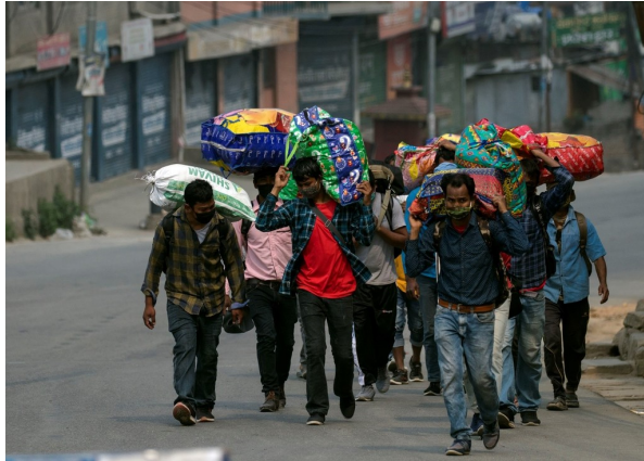
Wage workers from Bardiya, Kailali and Kanchanpur returning home by foot from Kathmandu after the government imposed lockdown