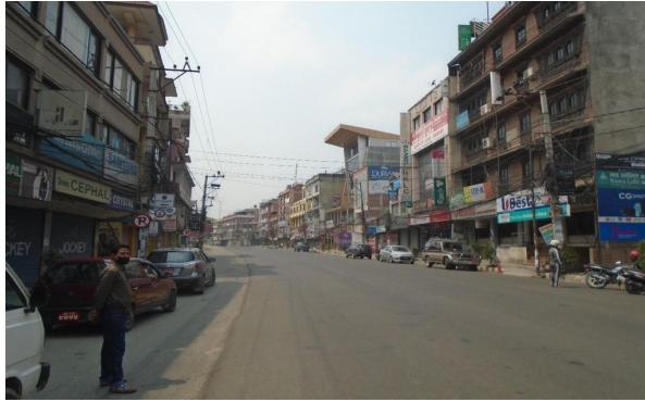
Lockdown Scene in Kathmandu