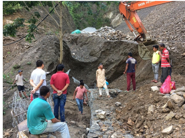
Road construction continues amidst pandemic in rural Nepal

I also place hope in communities' spirits of solidarity and compassion, as this has been a key source of resilience in survival and recovery from the disastrous 2015 earthquake. After the lockdown was eased on June 20, I visited a village in the Roshi rural municipality of the Kavre district, making sure that I adhered to the rules of social distancing, mask-wearing, and hand washing. From the conversations I had with the people, I realized that while the community is anxious about the uncertain situation presented by the global pandemic, they are also dedicated to community solidarity and do what they can to extend support to one another. As soon as the lockdown was imposed, families called back their relatives working in cities. With the return of young people to villages, the atmosphere in these places revived somewhat, regaining a welcome vibrancy. They plowed some of the abandoned terraces for maize and vegetable cultivation and village religious rituals continued with necessary precautions. When I visited the village, road construction was ongoing. Now they have restricted interaction with outsiders, but they are confident that they can still manage to support the relatives yet to return from abroad and are ready to welcome them back into the community.