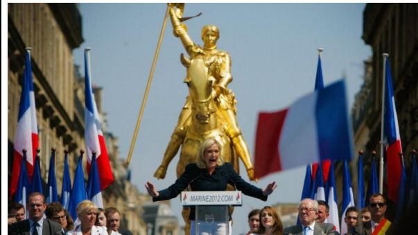
Joan of Arc and the French National Front- their May 1 st as counter narrative to the International May Day.

Tsukuru-kai network hinted at the strength and structure of the burgeoning neo-nationalism.