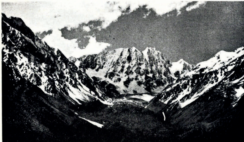
Ramsay Glacier, 1949, showing further lowering of glacier surface since 1910