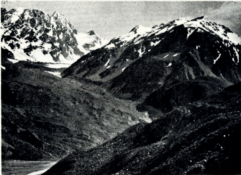
Ramsay Glacier from Mein's Knob in 1910, showing stranded lateral moraine on east side, and eastern end of terminal face in contact with Jim's Knob. Mt. Whitcombe at left