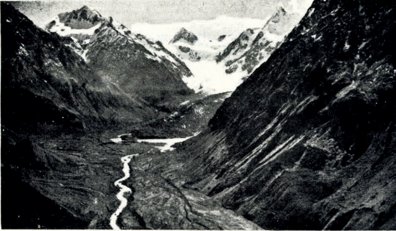
Lyell Glacier from Mein's Knob in 1949. Note recessional moraines and lake, and prominent moraine mound at left. Peaks are, from left to right: Mt. Goethe, Mt. Nicholson and Malcolm Peak (2510 m.) (see text, p. 504 et seq.)