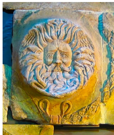
Figure 3. | Gorgon head from pediment of the temple of Sulis-Minerva at Bath Spa.

With its creative use of coloured lights and holograms around the ancient ruins of the thermal springs, The Roman Baths