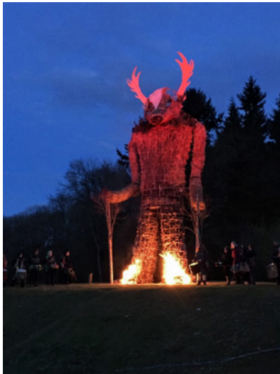
Figure 2. | Wicker man (Cernunnos) being burnt at Butser Ancient Farm April 2016.

As the spoof band members in the cult movie This is Spinal Tap say: 'Nobody knows who they were or what they were doing...' Because we