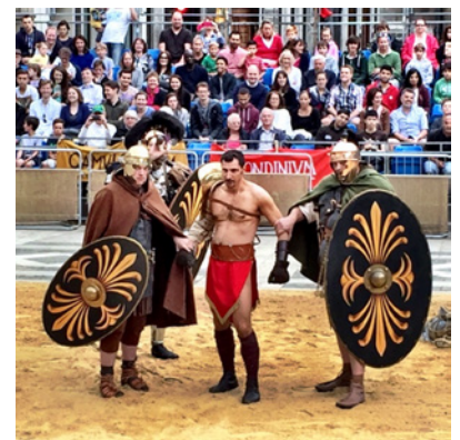
Figure 4. | Gladiator Games at London's Guildhall, August 2015.

Underneath London's Guildhall are the remains of an amphitheatre for beast fights, gladiatorial combats and other Roman hijinks. Sometimes you