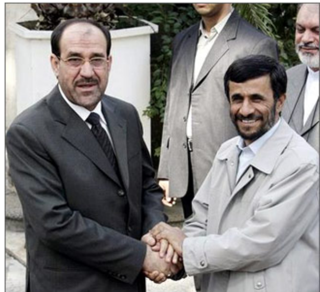
Prime Minister Nouri Al-Maliki (left) greeted by Iranian President Mahmoud Ahmadinejad on his first visit to Tehran

The three-day visit to Tehran by Iraqi prime minister Nouri al-Maliki in August 2007 (his second in a year) is awkward for the US government; not least, it contributes to the political chaos in Baghdad by alienating further the leading Sunni political representatives who have resigned from the government (a situation which the Shi'a -Kurdish deal announced by Iraq's president, Jalal Talabani, on 16 August is unlikely to reverse).