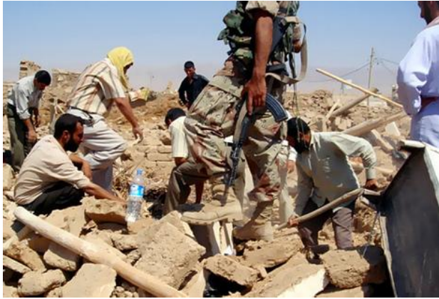
Search for survivors following the Ninevah truck bombing

This presents a problem for US forces, whose intensive concentration on the "surge" strategy in Baghdad and other selected areas means that are no longer present in large numbers in Mosul; this makes it easier for formerly Baghdad-based insurgents to regroup and operate elsewhere. But if the vulnerability of communities such as the Yezidi to insurgent attack in such circumstances is thereby exposed, it would be wrong to conclude by default that the surge in Baghdad itself is working.