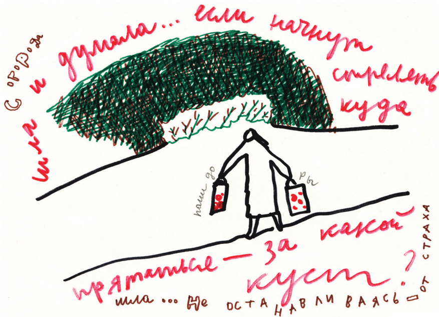
Figure 2. one of the drawings from the November 13, 2015 post in the Strawberry Andreevna project, https://www.facebook.com/truealevtina/photos/pb.100069212646514.-2207520000/520225008150854/?type=3 .

Looking at Ukrainian poetry's war responses in social media feeds as part of a polyphonic multimedia interaction provides a highly important contextualization, but precisely because of the ephemeral nature of social media this context is difficult to document and reconstruct. Often, one needs to rely on projects beyond social media for a synthesizing perspective. Thus, Boris Khersonsky's (Borys Khersons'kyi's) social media feed as a literary project (begun on LiveJournal and continued on Facebook) is one of the best-known and longest-lasting ones in the Ukrainian context. Its texts elicit different appreciation when collected in book form, however; in many cases, until the untimely passing of the artist Oleksandr Roitburd, Khersonsky's books also contained many images by Roitburd in direct and explicit dialogue with the poet's texts. 3 Similarly, anthologies like Litopys samovydytsiv: Dev'iat' misiatsiv ukrains'koho sprotyvu (Chronicle of Witnesses: Nine Months of Ukrainian Resistance), published in late 2014, was an ambitious and transformative presentation of social media posts, from brief observations to poetic and essayistic texts of varying length, which reflected both the revolution as it unfolded and the editors' perspective on its textual (and visual) representation.