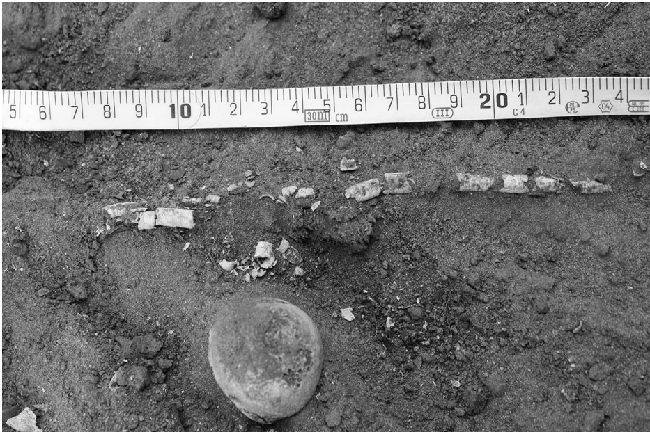
Figure 1.1 Remnants of a calcified artery in a burial at Amara West (Sudan) in situ upon recovery.