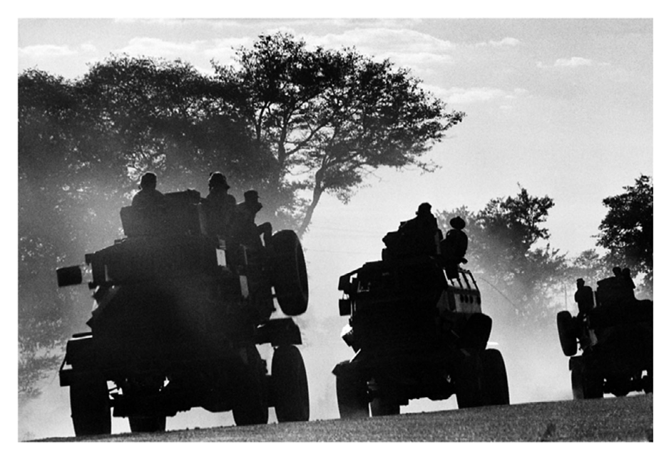
Figure 1. A Koevoet patrol returns to base at Oshakati in 1988.

disrupted by the war, and how he and his classmates would go to watch their fathers, brothers, and uncles train on the parade ground. He remembers Ovambo children not much older than himself forced to enlist into Koevoet (Afrikaans: "crowbar"), the counterinsurgency unit that the South African Police (SAP) operated in northern Namibia during the 1980s.<sup>3</sup> He remembers his father teaching him to handle a firearm before he was ten. He remembers the PLAN (People's Liberation Army of Namibia) fighters emerging from the bush and the shooting that followed.