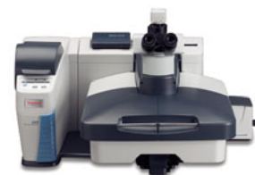
Thermo Scientific DXR Raman microscope

Reserve your spot today! Space is limited.