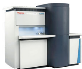
Thermo Scientific K-Alpha