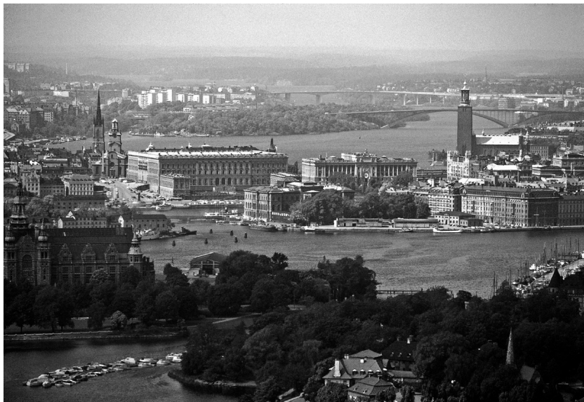
FIGURE 1.1 Stockholm during UNCHE in the early summer of 1972.

of change, we can identify new chronologies – indeed new “spaces of experience” and “horizons of expectation,” to use Reinhart Koselleck’s concepts. 13 Such fears and hopes of the Anthropocene are closely associated with features of the environment such as climate, biodiversity, the cryosphere, forests, and oceans.