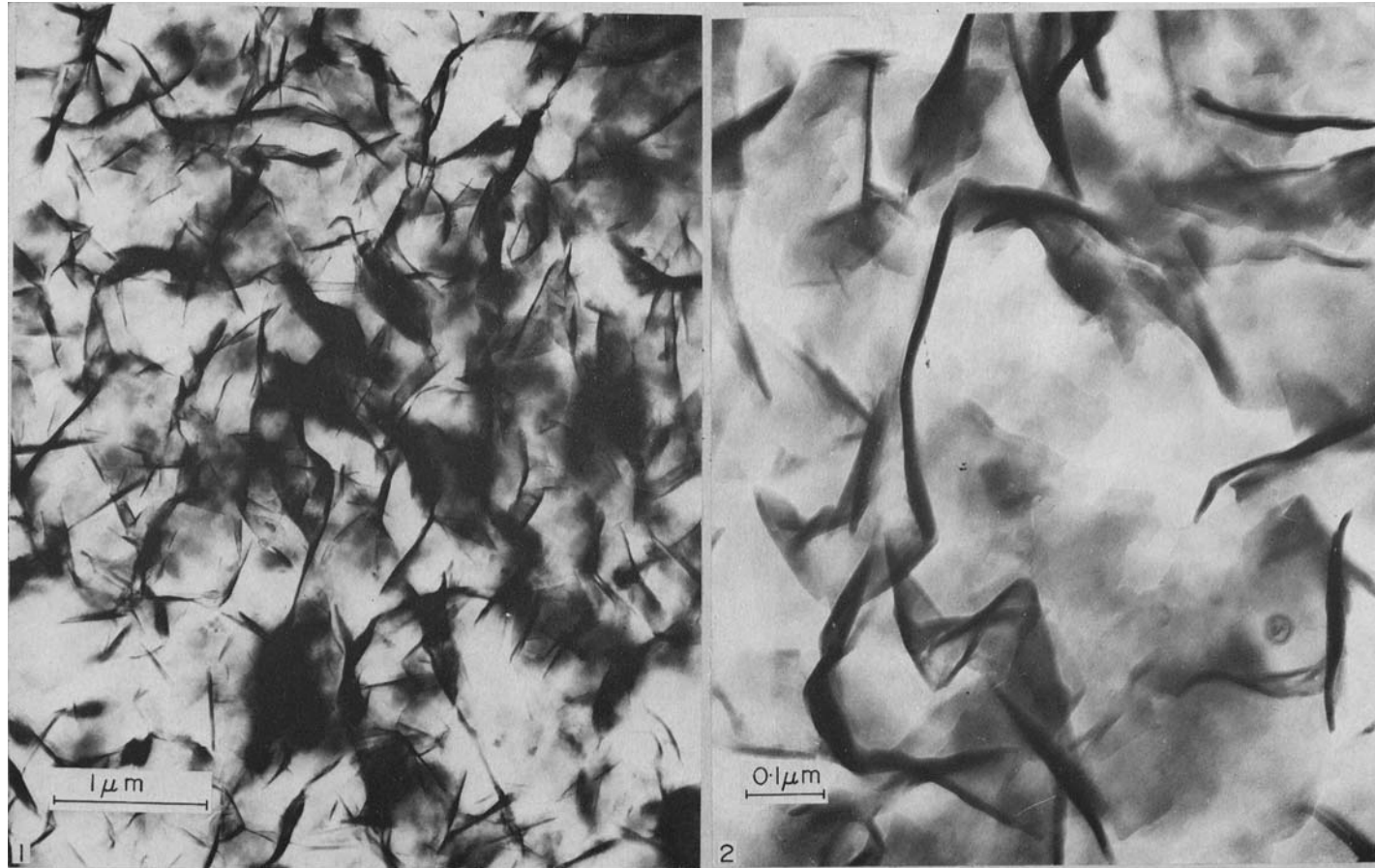
Fig. 1. Electron photomicrograph of dimethyldioctadecylammonium-montmorillonite dispersed ultrasonically and critical point dried, 41,200 \times .

The Publisher wishes to apologize for the omission of the following Figures (1-4) from the note entitled "Critical Point Drying of Electron Microscope Samples of Clay Minerals" by D. L. JERNIGAN and J. L. MCATEE, JR. Clays and Clay Minerals 23 (2), 161-162 (1975).