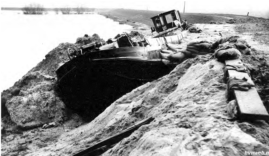
Figure 1.4 Plugging a hole in a dike near Nieuwerkerk aan den IJssel with the boat De Twee Gebroeders .

stated in Gerritsen (2005): “Until the middle of the twentieth century, a dike was largely characterized by its height. Very little was known about the factors influencing its strength or failure mechanisms. [. . .] The dike height was simply the height of the highest recorded high water plus a safety level of approximately half a meter.” Whereas a combination of statistical analyses based on historical data combined with the strengthening of individual (typically smaller) dikes still played a very important role, the Delta Plan contained in particular the construction of major new dams and barriers (13 in total) across the southwest delta area of The Netherlands; see Figure 1.5.