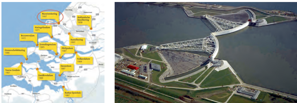
Figure 1.5 Left: The original 13 storm dikes and barriers from the Delta Works. Right: The Maaslandkering when closed.

stated in Gerritsen (2005): “Until the middle of the twentieth century, a dike was largely characterized by its height. Very little was known about the factors influencing its strength or failure mechanisms. [. . .] The dike height was simply the height of the highest recorded high water plus a safety level of approximately half a meter.” Whereas a combination of statistical analyses based on historical data combined with the strengthening of individual (typically smaller) dikes still played a very important role, the Delta Plan contained in particular the construction of major new dams and barriers (13 in total) across the southwest delta area of The Netherlands; see Figure 1.5.