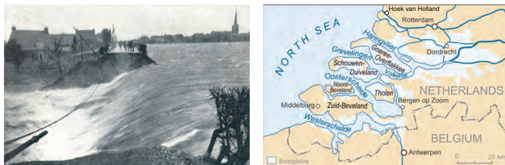
Figure 1.1 Left: The 1953 great flood in Zeeland and Holland. Right: The area flooded where we have additionally pointed out the location of Hoek van Holland.

In 1953 media warnings were extremely restricted; essentially only one warning was given, which was probably missed by many people. After 00:00 that night, no further warnings were transmitted to the population until 08:00 that Sunday morning, February 1. As every night, the radio program ended that Saturday midnight with the Wilhelmus , the Dutch National Anthem. The consequences were disastrous. People in Zeeland and Holland, who for centuries have been aware of the threat posed by living near the sea, went to bed trusting the existing dikes. That night the storm battered the coast with ferocious power. The ensuing seawater surge toppled the first dikes at around 02:00 Sunday morning, well before the expected high tide of 05:00. About one hour later, numerous other dikes along the coast of Zeeland and Holland started to collapse, and the resulting flooding was enormous; see Figure 1.1. Events