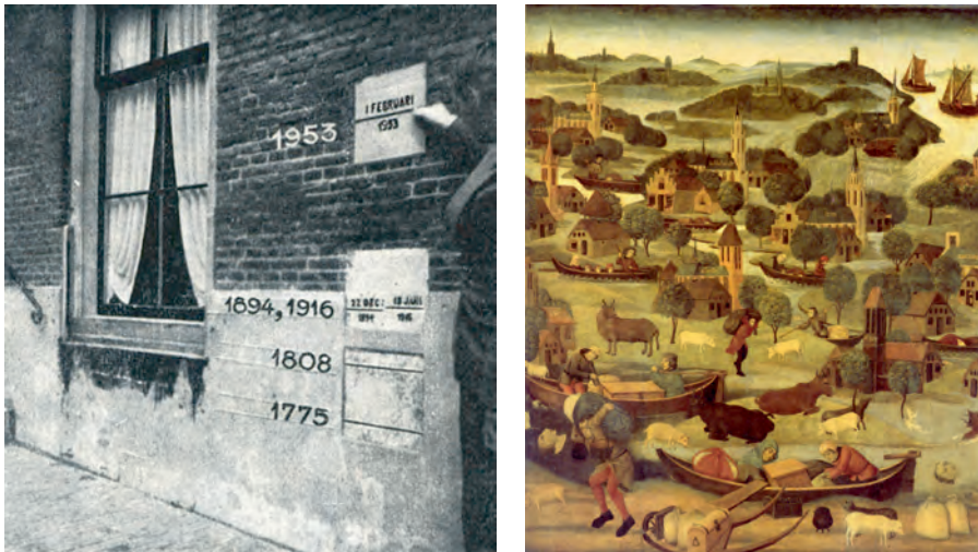
Figure 1.2 Left: Flood marks in the delta area of Zeeland. Right: The Saint Elisabeth flood of November 19, 1421, Master of the Saint Elisabeth panels.

About a third of The Netherlands lies below sea level, with about two thirds being prone to flooding. The lowest point of The Netherlands, standing at minus 6.76 m, is Nieuwerkerk aan den IJssel (after a merger, now referred to under its new name Zuidplas). It is situated about 10 km northeast of Rotterdam. Under such extreme topographic conditions, an understanding and communication of (especially) flood risk is highly relevant and “living with risk” becomes very tangible. Historically, the protection of the country by coastal as well as river dikes has always been of eminent importance. Below we will give a brief discussion of the world famous Delta Works project, which finds its origin in the 1953 flood event. First however, let us define what we understand by the above “minus 6.76 m”. For that, one clearly needs a proper gauge. In the case of The Netherlands, this is the NAP = “Normaal Amsterdams Peil”, a well-defined North Sea average level, also referred to as the Dutch National Ordnance level; see Figure 1.3. NAP is also officially the zero level within the European Union. Storm surges and low/high geographical points are always recorded and communicated relative to the NAP. In the case of the 1953 flood, the highest water level reached at Hoek van Holland was 3.85 m above NAP whereas for Zeeland this was 4.55 m above NAP.