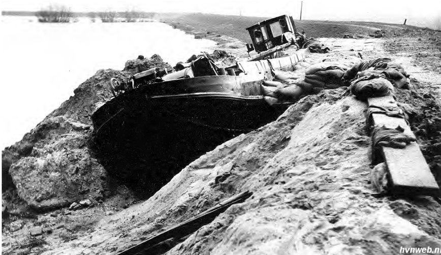
Figure 1.4 Plugging a hole in a dike near Nieuwerkerk aan den IJssel with the boat De Twee Gebroeders .

stated in Gerritsen (2005): “Until the middle of the twentieth century, a dike was largely characterized by its height. Very little was known about the factors influencing its strength or failure mechanisms. [...] The dike height was simply the height of the highest recorded high water plus a safety level of approximately half a meter.” Whereas a combination of statistical analyses based on historical data combined with the strengthening of individual (typically smaller) dikes still played a very important role, the Delta Plan contained in particular the construction of major new dams and barriers (13 in total) across the southwest delta area of The Netherlands; see Figure 1.5.