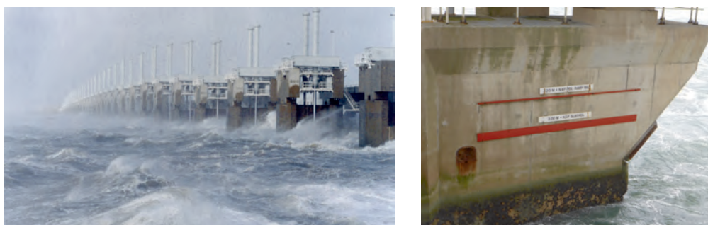
Figure 1.6 Left: The Oosterscheldekering at Neeltje Jans. Right: Its 3 m and 4.20 m storm-surge markers.

moveable gates, each arm reaching in length the height of the Eiffel Tower; see Figure 1.5. They are designed to protect the important harbor of Rotterdam and its surroundings. The flood barrier at the Oosterschelde warrants a more detailed discussion; see Figure 1.6. The delta area of the Oosterschelde in Zeeland suffered the highest number of casualties during the flood. Original planning started in 1960, initially aiming at a fully solid dam closing off the delta area. This section of the Delta Works, however, took 26 years to complete, far more than any other section and at a considerably higher cost than that originally estimated. The main reason was that, early on, pressure from the local fishing industry as well as an increased environmental awareness caused a fundamental rethinking of the original plans. Prevention of the free in- and outflowing of seawater would destroy the rich delta fauna and flora and impair the livelihood of many people. By 1975, a solution was reached consisting of a 9 km barrier with 62 moveable steel gates that would close as soon as the sea level at a well-defined point along the coast reached 3 m above NAP. In 1953, at that particular location, the level stood at 4.20 m above NAP; see Figure 1.6. There is a further triggering