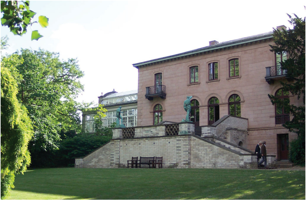
The former Strömgren residence of honour, seen from the park.