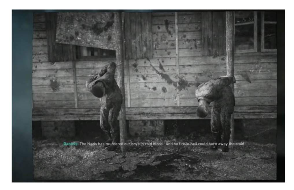
Figure 2. Screenshot captured from a Call of Duty WW2 Walkthrough courtesy of Alon Ventura.

Although only a few images from the historical camp are available, the depiction of Berga in Call of Duty: WWII inevitably shares significant visual resemblance to historical photographs and footage taken during and after the liberation of Nazi concentration camps and thereby relies heavily on the visual memory of the camps (Wildmann and