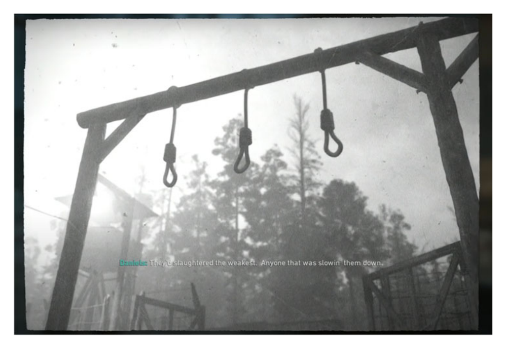
Figure 3. Screenshot captured from a Call of Duty WW2 Walkthrough courtesy of Alon Ventura.

Honke, 2020: 124); Stiles's black-and-white photographs of the gallows, deserted barracks, and hanged corpses evoke historical images of Nazi concentration camps (Figures 4 and 5). As players are immersed in the game, these playful images might easily be overlooked. We applied the VWM to take a step back from the immersive game to closely inspect the