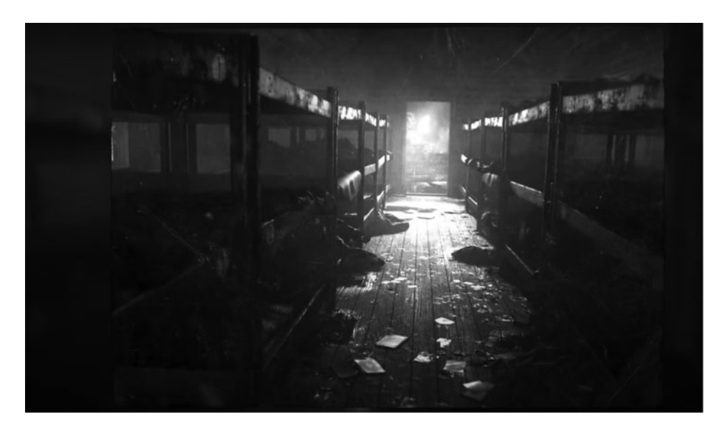
Figure 1. Screenshot caprutred from a Call of Duty WW2 Walkthrough.

again to Stiles's camera, showcasing black-and-white photographs of the depicted atrocities (Figures 2 and 3).