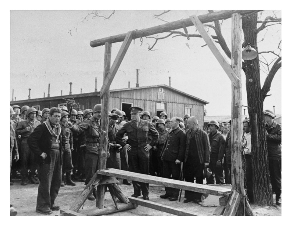
Figure 6. A photograph of the gallows taken during an official tour of the newly liberated Ohrdruf concentration camp of General Dwight Eisenhower.

images. These playful images mainly serve as abstract visualisations of typical horrors of a concentration camp, entrenched in popular visual memory. Though resulting from the individual player's creative play, they limit the possibilities of playful interaction, such as exploring the historical originals or learning more about concrete incidents or the provenance of the pictures.