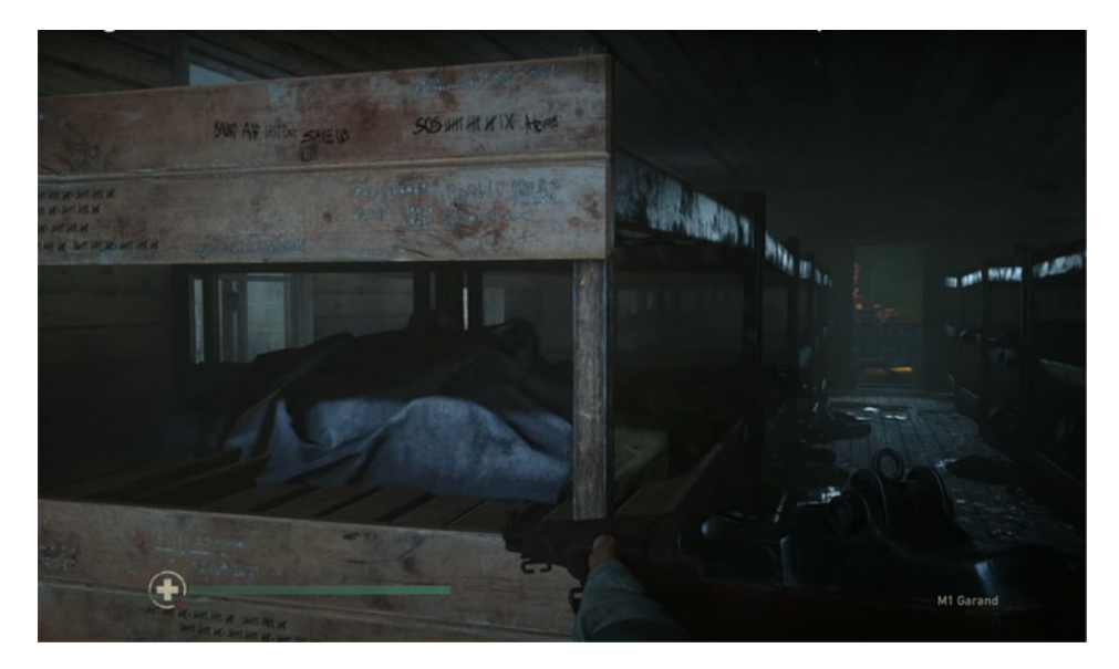
Figure 4. Screenshot captured from a Call of Duty WW2 Walkthrough courtesy of Alon Ventura.

Honke, 2020: 124); Stiles's black-and-white photographs of the gallows, deserted barracks, and hanged corpses evoke historical images of Nazi concentration camps (Figures 4 and 5). As players are immersed in the game, these playful images might easily be overlooked. We applied the VWM to take a step back from the immersive game to closely inspect the