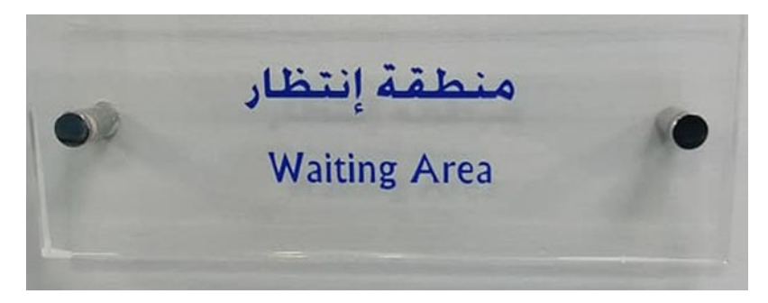
Figure 1. 'Waiting Area' sign in Arabic-English duplicating bilingual writing

Fieldnotes and observations within the on-site fieldwork were written down to provide an ethnographic context for the LL items (see Alomoush, 2021b). Based on my observations of linguistic practices and patterns in use in medical settings, I draw conclusions about a dominant bilingual ideology, i.e. Arabic–English, while 'attitudinal and perceptual information' can also be 'gleaned from observation' (Schilling, 2013: 92).