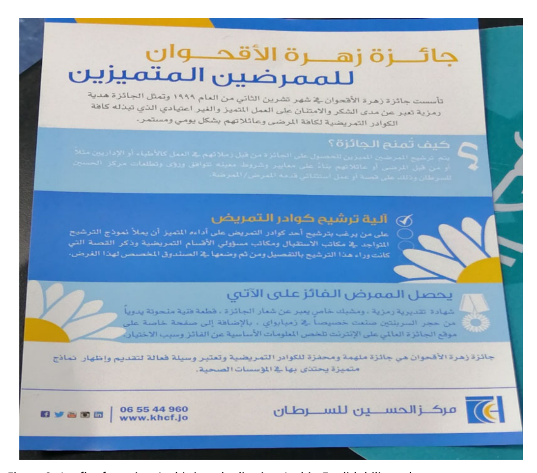
Figure 9. Leaflet featuring Arabic in a duplicating Arabic-English bilingual pattern

room names such as منسقة الاشعة 'Diagnostic Radiology Department coordinator' and غرفة خرفة 'Cannulas Insertion Room'.