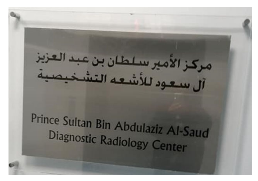
Figure 5. Example of medical centre name signs in Arabic-English-Romanised Arabic combination

Certificates of accreditation are exclusively provided in English, which is aimed at symbolising high standards of professionalism and competence to perform medical procedures. According to The Jordan Times (2019), the King Hussein Cancer Centre was given the award of 'MAGNET