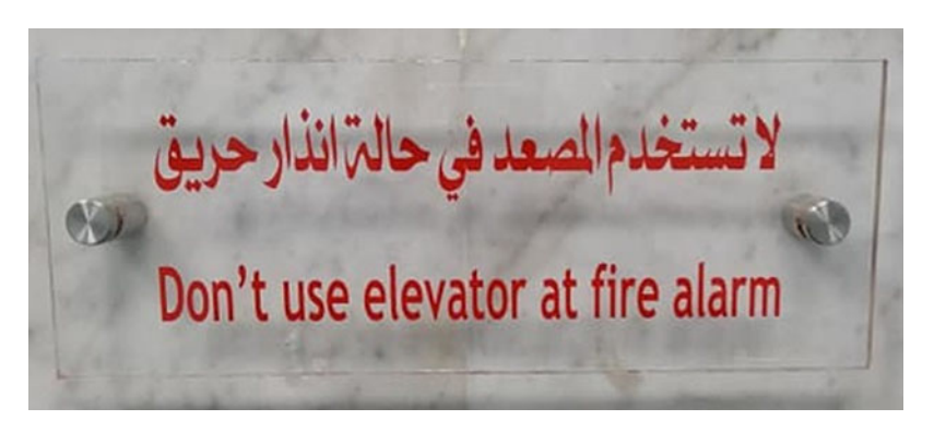
Figure 4. 'Don't use elevator at fire alarm' sign

In addition to detailed administrative reports such as radiology reports, such as CT scans, ultrasounds, MRI, and liver function reports which are exclusively written in English, monolingual English signs (25 of 164 occurrences, 15.3%) are scattered everywhere in the Centre, instances of which include a range of instructions such as Pull and Push bar to open . Figure 6 shows Avagard Instant Hand Antiseptic placed for patients and visitors to the Centre near waiting areas, to kill germs on one's hands that may spread diseases, especially COVID-19.