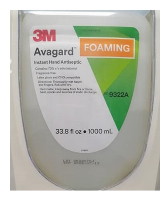
Figure 6. Monolingual English label on Avagard Foaming Instant Hand Antiseptic products

Certificates of accreditation are exclusively provided in English, which is aimed at symbolising high standards of professionalism and competence to perform medical procedures. According to The Jordan Times (2019), the King Hussein Cancer Centre was given the award of 'MAGNET