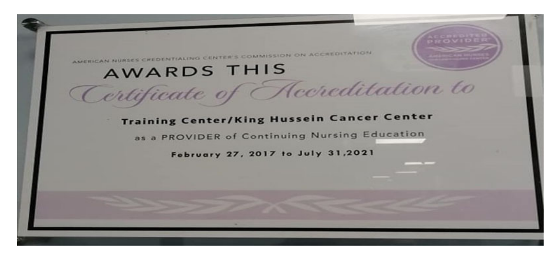
Figure 7. Example of a certificate solely in English placed near main entrances and exits

the sense that signs are presented in both Arabic and English.