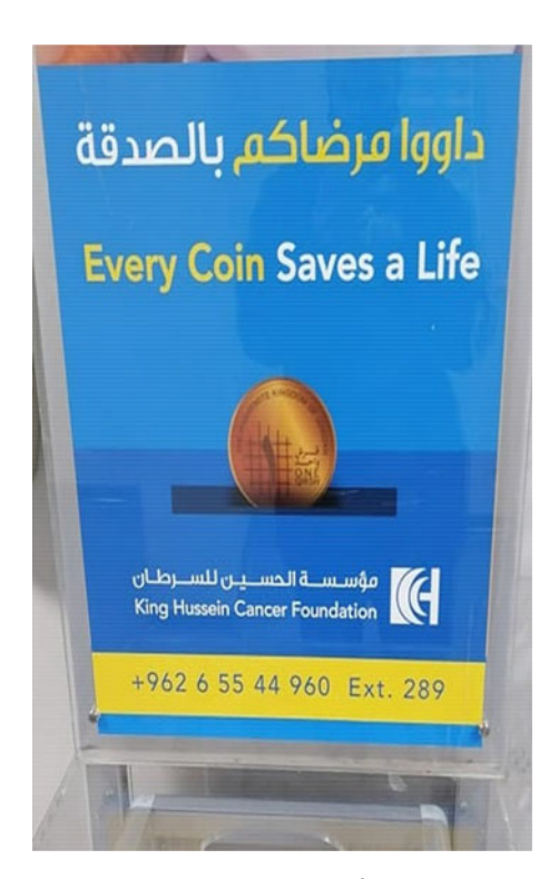
Figure 3. Coin donation box featuring both Arabic and English in a duplicating bilingual format

Coin donation boxes are very widespread and contribute to fundraising campaigns to save the lives of the poor who cannot afford the high expenses of cancer medications and operations. To attain this goal, both Arabic and English in a duplicating format are used to publicise the Centre's fundraising campaigns. The coin box in Figure 3 is duplicated in both Arabic and English. The Arabic wording بداووا مرضاكم بالصدقة Literally meaning 'Treat your