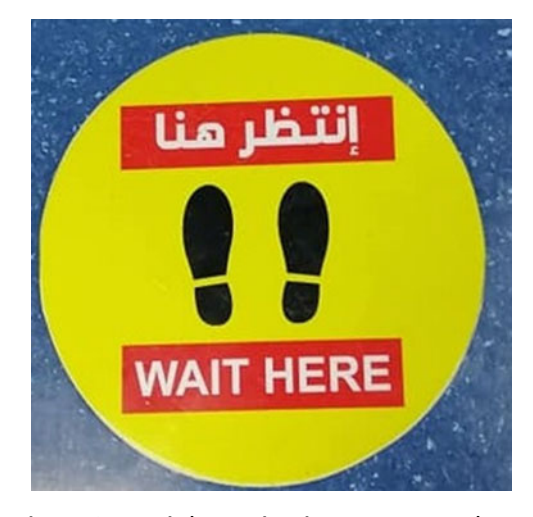
Figure 2. 'Wait here' sign in response to the spread of COVID-19

The majority of linguistic tokens collected in the current study are visible in both Arabic and English in a wholly duplicating bilingual pattern. In most