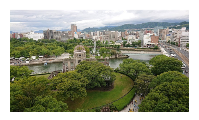
A view of the A-bomb Dome in the Hiroshima Peace Memorial Park from the

After all, it was the idea of peace that connected "ruins" and "reconstruction." The notion of peace exerted the magic-like power mentioned earlier, and became a driving force for gaining governmental support. Support for "ruins preservation theories" that called for preservation of the hypocentre as a symbol of peace quickly lost support with the emergence of the call for city development in the name of peace. Here, "peace" and "development" merged without contradiction.