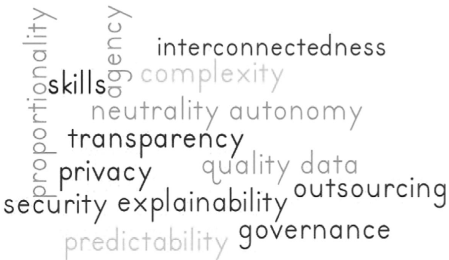
FIGURE 3.2 Regulatory themes