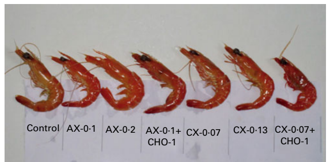
Fig. 2. Colour of boiled Penaeus monodon fed on the seven experimental diets. AX, astaxanthin; CX, canthaxanthin; CHO, cholesterol.