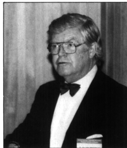
D. Allan Bromley, Assistant to the President for Science and Technology, and Director of the Office of Science and Technology Policy.

BROMLEY: Yes, it is. The fact that it is called the National Critical Materials Council doesn't mean that it focuses only on critical materials, although it does publish an interval report on critical materials. It also focuses in a major way on advanced materials and is responsible for developing the national program plan for advanced materials. It also will take the report of the [National] Commission on Superconductivity and update that on a periodic basis.