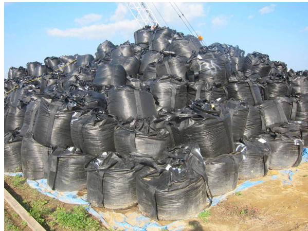
Dump of contaminated soil, Fukushima