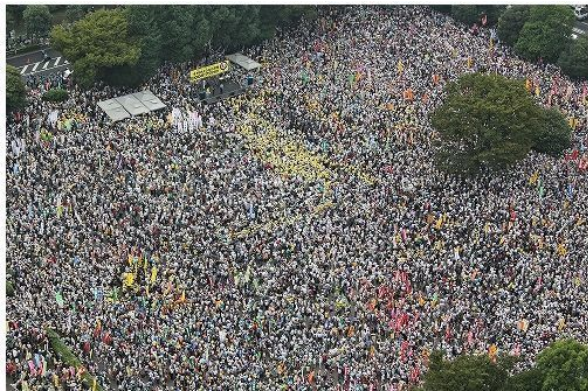
Demonstration in Meiji Park, Tokyo, 19 September 2011

Shimbun. 29 NHK could more often than not be bothered to send a camera to Yoyogi Park, a stone's throw away, to interview protestors there.