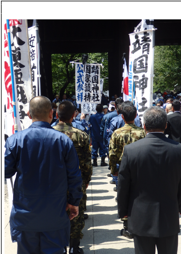
Yasukuni on the 70th anniversary of Japan's WWII surrender

For example, the book instructs editors, translators and journalists to avoid using the expression ‘so-called comfort women’ and “in principle” to avoid giving explanations of what they were: “Do not use ‘be forced to,’ ‘brothels,’ ‘sex slaves,’ ‘prostitution,’ ‘prostitutes’ etc.” 55 While careful not to deny the Nanjing Massacre, the book says the 1937 destruction of the Chinese capital by the Imperial Japanese Army must be referred to only as “the Nanjing Incident”. “‘The Nanjing Massacre’ is used only when directly quoting remarks made by important people overseas etc., when the fact that it is a quotation must be made clear.” In reference to Yasukuni, the Shinto shrine that venerates Japan’s wartime leaders along with its 2.4 million war dead, NHK employees must avoid English expressions such as “war-related shrine,” “war-