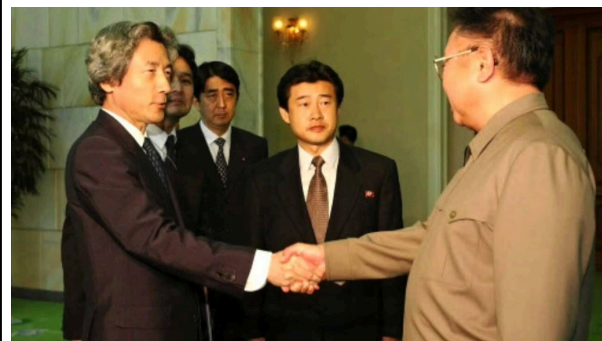
PM Koizumi Junichiro meeting Kim Jong-il, September 2002

based reporter from the 15 European Union member nations was allowed to accompany him. During the investigation into the 2000 murder of British hostess Lucie Blackman, foreign reporters were barred from police press conferences. 15 Both incidents were cited in a landmark European Commission report in 2002, which criticized the press club system for impeding reporting “of events of widespread international interest and significance.” 16