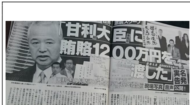
Shukan Bunshun, “I gave Minister Amari a 12-million-yen bribe”