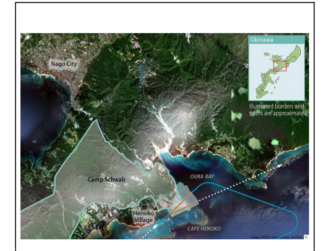
Location of Proposed Futenma Replacement Facility at Henoko, Nago City

In May 2006, the "U.S.-Japan Roadmap for Realignment Implementation" spelled out the second Henoko plan (the design still current). It called for the construction of a base featuring two 1,800 meter-runways in a V-shape, extending from the existing U.S. Marine Corps facility at Camp Schwab into Oura Bay to the West and Henoko Bay to the East.