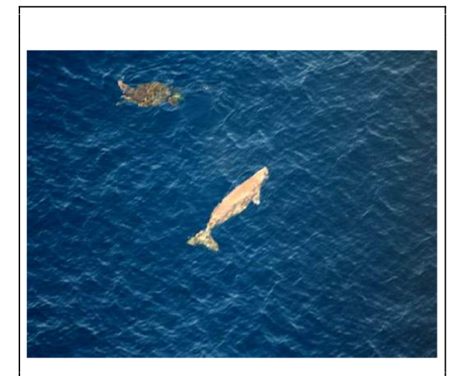
Dugong and Turtle, (Photograph by Higashionna Takuma, a plaintiff in the San Francisco Court action), [Oura Bay, March 2004]

were confirmed in the seagrass beds of the Kayo District [i.e. several kilometers distant from the designated base site], but none were confirmed in the Henoko district"<sup>15</sup> subsequent surveys, both by NGO teams<sup>16</sup> and by the Japanese government itself (Okinawa Defense Bureau),, <sup>17</sup> called into question the accuracy of the EI surveys and, much more significantly, the accuracy and wisdom of the conclusion that the FRF would have no adverse effects on the dugong. The "no adverse impacts" prediction of the EIS, based upon its survey results, collapses.