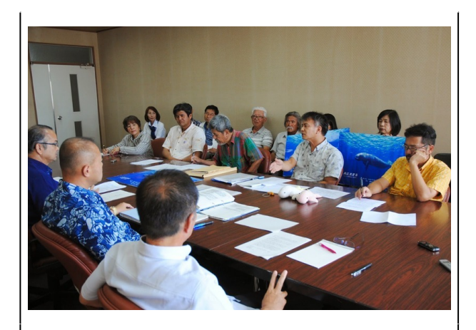
Fact finding meeting between NGOs and Okinawa Prefectural Government, June. 6, 2014 (author with arm raised, speaking)