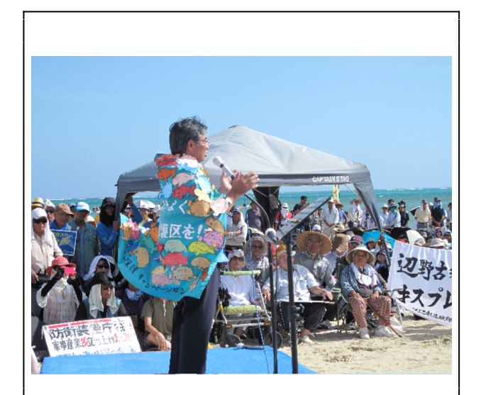
Nago Mayor Inamine Addresses Henoko Beach Protest Meeting, September 20, 2014