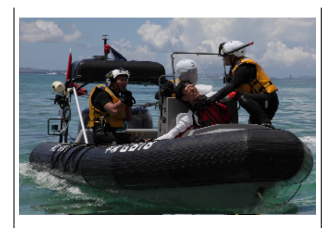
Henoko: Protesting Canoeist seized by Coastguard, (Photo: ©Tomoyuki Toyozato)

On July 1, 2014, the ODB started the construction phase of the Henoko plan on Camp Schwab amid fierce protest from local citizens and municipal governments. The Japanese government had adopted heavyhanded approaches to carry out the Henoko plan. With approval from the U.S. military, the Japanese government created new "temporary restricted water areas," expanding the previous off-limit zone of 50 meters off-shore from Camp Schwab to two kilometers, mobilizing an armada of vessels under the command of the Japanese Coast Guard and beginning to drive away, or to "capture" and "release" protesters venturing towards the site in canoes and kayaks,8 threatening them with prosecution under the infamous keitoku ho (a draconian, rarely used, "special" criminal law dating to 1952. The Okinawan media reported (September 12) that "[a]cts of violence are taking place on a daily basis," and that assault proceedings had been initiated against three of the Coast Guard officers.<sup>10</sup>