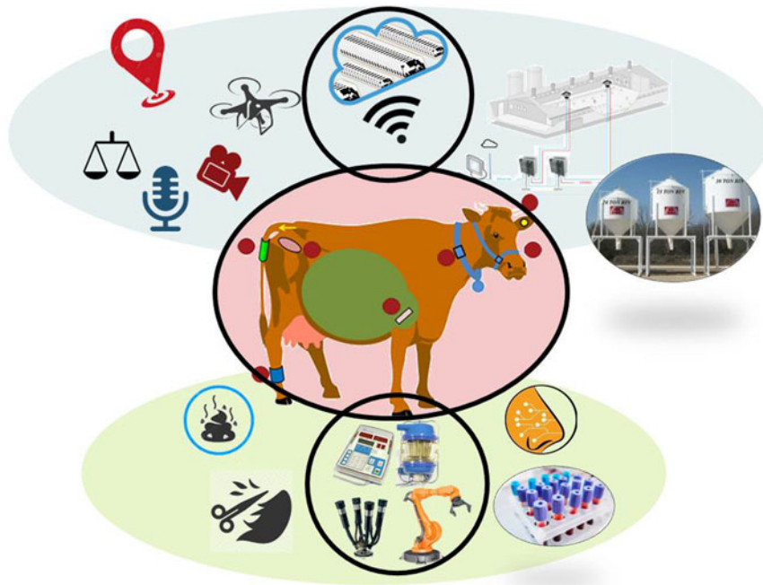
Figure 1 (colour online) Overview of sensor technologies associated with dairy animals (example is dairy cow but others could apply equally well). The red zone and individual red dots show 'At Cow' sensors, chiefly accelerometer based but also in some cases including temperature, heart rate and pH analysis. The blue zone shows 'Near Cow' sensors such as video and sound analysis, climate analysis, feed analysis, GPS and interaction with the cloud (the latter two classified as 'near' on the basis of enabling real-time analysis). The green zone shows 'From Cow' sensors that monitor products coming from the cow (milk, hair, saliva, sweat, nasal secretion, breath, faeces, etc.). The black circles represent the main technologies that are commercially available and in widespread use. A cow is shown as example; many of the technologies are also applicable to other dairy ruminants. The figure is not exhaustive.

which takes us back to our earlier statement questioning whether sensors (yet) improve health and productivity. It is perhaps relevant that a recent meta-analysis of human activity trackers (sensors) concluded that almost all of a large research base (850/857 studies) were poorly controlled and 'No evidence was found for the effect of wearable activity trackers, on physical-activity-related outcomes' (Böhm et al. , 2019). Before considering whether these problems can be overcome such that sensors do have a future, it is important to have a fuller picture of the range of sensors that are available or conceived of.