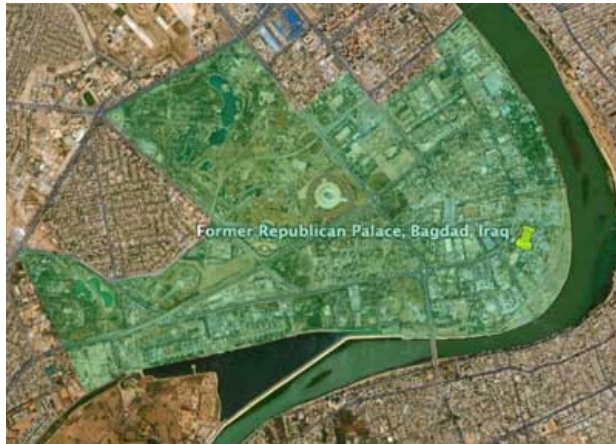
The Green Zone

no longer have sectarian killings by ID cards [revealing that a person is Sunni or Shia by their name] but Sunni are still afraid to go to Shia areas and Shia to Sunni.