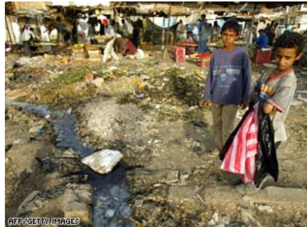
Cholera cases reached 2,000 in 2007 according to the UN

chemicals for water purification from Iran by corrupt officials. Everybody talked about the cholera except in the Green Zone where people had scarcely heard of the epidemic.