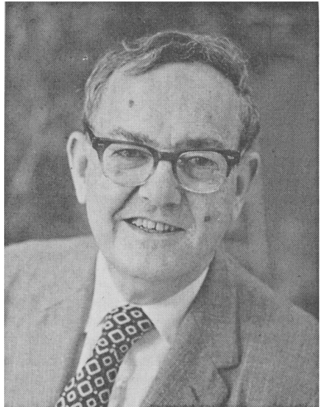
Herbert A. Simon will receive the Madison Award for distinguished scholarly contribution to political science.

"Lasswell and Orwell: The Relationship between Political Language and Political Reality" is the theme of the 1984 Lass-