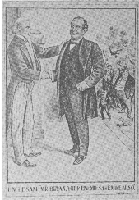
The J. Doyle DeWitt Collection of Political Americana will be displayed at the APSA Annual Meeting.

Among its highlights are hundreds of presidential campaign artifacts in china, glass, metal, wood, and textiles; an important Lincoln collection; material dealing with the political history of the Confederacy; an extensive assortment of nineteenth century cartoons; material associated with women's rights, temperance-prohibition and civil rights movements; campaign music and original voice recordings of candidates dating back to Benjamin Harrison; a research library strong in early pamphlets and