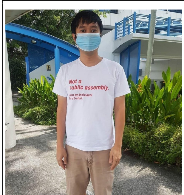
Migrant workers' activist who apologized to Minister Teo for wearing ironic t-shirt

Josephine Teo, the Minister of Manpower, was asked in Parliament if she might consider offering an apology to the migrant workers "given the dismal conditions that they are currently in". Betraying an extraordinarily flippant indifference to the structural inequality between her and her wards, who oscillated between fear of infection from their fellow dorm-mates and concern about deportation to even more chaotic circumstances, Minister Teo replied, "...I have not come across one single migrant worker himself that has demanded an apology" (Zhang, 2020).