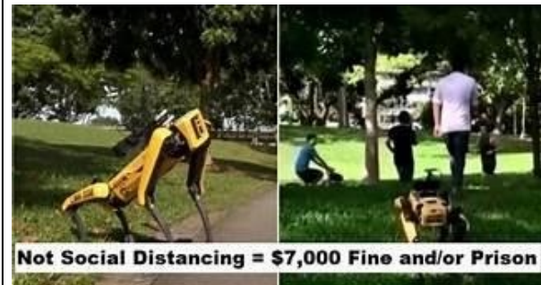
Robot dogs enforce social distancing in parks

If the pandemic proved that even these hyper-credentialed and highly-paid elite are not immune to bungling, it also demonstrated the impressive capacity of working-class Singaporeans to self-organise and practice solidarity. In the face of socioeconomic precarity aggravated by the lockdown, various ground-up initiatives emerged -- from Facebook groups to support freelancers, to volunteer associations that directed donated laptops to low-income students who were struggling with the sudden switch to home-based learning, to campaigns to provide phone top-up cards for trapped migrant workers to call home. Social media exploded with calls encouraging better-off Singaporeans to donate their government cash pay-out to those in need.