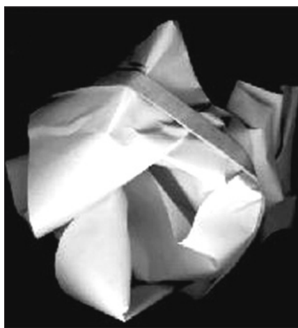
Figure 2. A crumpled piece of paper illustrates the open problem of understanding the development of memory and the focusing of energy in correlated matter.