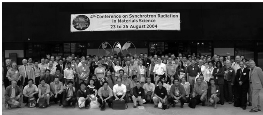
The 4th International Conference on Synchrotron Radiation in Materials Science was held August 23–25, 2004, in Grenoble, France. More than 230 participants from 30 countries attended the conference.

The conference illustrated rapid progress in a variety of areas of materials science. It was noted that the use of high-energy photons, in situ studies, time-resolved investigations, and a combination