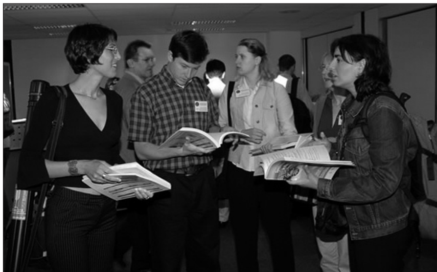
SRMS-4 drew the attention of young researchers.

High-pressure studies are another area where a combination of techniques is gaining momentum, and in particular, spectroscopic studies such as high-pressure emission, inelastic, and nuclear resonant techniques will give valuable information on electron structure and phonon dynamics