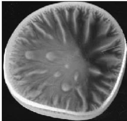
Figure 3. A bacteria-induced fluid convection pattern in a half-inch-diameter fluid drop.