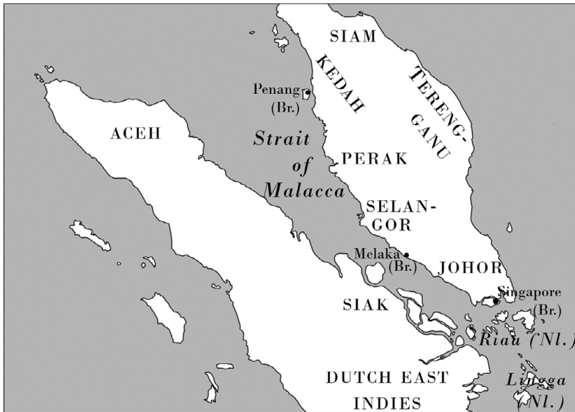
Map 3: The Strait of Malacca

As in the Indian Ocean, the Portuguese tried to establish the cartaz system in the Strait of Malacca (and other parts of maritime Southeast Asia), but they had too few ships at their disposal in order to enforce it efficiently. Meanwhile, the decline of Melaka paved the way for the rise of Aceh in northern Sumatra and for Johor in the Riau Archipelago, both of which competed fiercely for the remainder of the sixteenth century with the Portuguese and with each other for dominance in the Strait. As in the southern Philippines, maritime violence and raiding were the dominating form of warfare in the struggle for power in the Strait of Malacca throughout the early modern era.