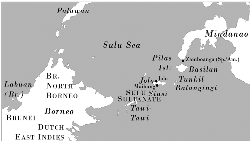
Map 2: The Sulu Sea

kingdoms to expel Muslims from the Iberian Peninsula from the eleventh to the fifteenth centuries. The Spanish consequently labelled their Muslim adversaries in the Philippines ‘Moros’, a condescending term for Muslims derived from the Mediterranean and Iberian context. From the point of view of the Spanish, and to some extent also from the point of view of the Moros, the protracted conflict was interpreted as part of a long-standing global struggle between Christianity and Islam. 1 In the course of this struggle, and as a result of increased contacts with the wider world from the sixteenth to the nineteenth centuries, the Muslim identity of the Moros was strengthened, largely in opposition to the Spanish incursions and their attempts to propagate the Christian faith. 2