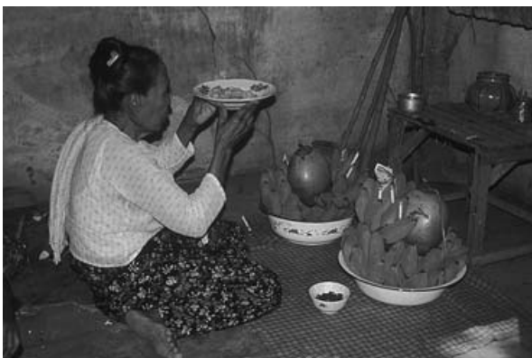
Plate 4 Shamaness at Myaleik Taung making an offering to supernatural beings known as nats prior to initiating our field survey. Villagers believe that tortoises are protected by nats inhabiting the mountain, and would not assist us until this ceremony was performed.

While there are probably as yet unidentified populations of G. platynota elsewhere in central Myanmar, those in Minzontaung Wildlife Sanctuary and Myaleik Taung are the only viable populations currently known and therefore of global conservation significance. Because local religious beliefs afford a high degree of protection and commercial poaching is so far non-existent both sites offer excellent prospects for star tortoise conservation. Although these areas are relatively