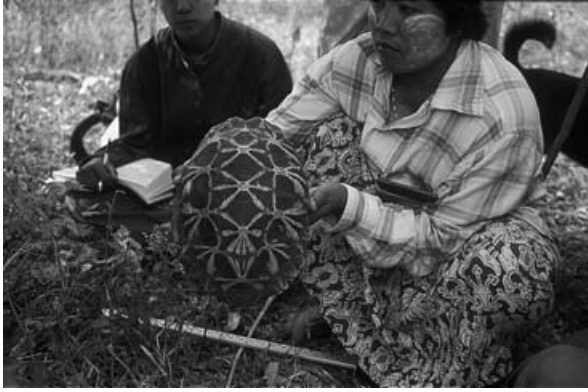
Plate 3 Female star tortoise captured in a fallow cotton field near the base of Myaleik Taung during March 2001. This was the largest star tortoise (carapace length = 27.8 cm) found in two years of fieldwork.

contrast, large tortoises were frequently encountered at Myaleik Taung indicating that exploitation has been minimal.