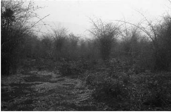
Plate 1 Bamboo brake at the base of Myaleik Taung. This photograph was taken during March 2001 at the height of the annual dry season. Note the lack of foliage and ground cover.

Forest Department recently proposed the designation of 3,240 ha of Myaleik Taung as the Myaleik Taung (Kwenahpa Taung) National Star Tortoise Sanctuary. The Dokhtawady River Valley below Myaleik Taung was settled in the early 1970s and is now densely populated. The composition of the original vegetation is somewhat speculative, but British military maps dating from World War II label the Dokhtawady Valley as “dense jungle, mainly bamboo” (Sheets 93 C1 and C5 issued by Survey Headquarters, Burma Command, November 1944), and Searle (1928) describes this area as “Bamboo Forest”. The river valley has since been converted to agricultural fields, and cultivation extends to the base of Myaleik Taung. Cotton, corn, and beans are the principal crops, and livestock graze in fallow fields. Agricultural fields are separated by narrow hedgerows of bamboo and thorn scrub (Plate 2), and small clumps of brush are scattered throughout, especially on rocky patches that cannot be tilled.