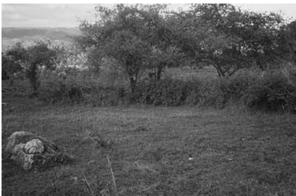
Plate 2 Agricultural habitat in the Dokhtawady River floodplain below Myaleik Taung. Star tortoises frequently utilize small hedgerows between fields as cover.

Forest Department recently proposed the designation of 3,240 ha of Myaleik Taung as the Myaleik Taung (Kwenahpa Taung) National Star Tortoise Sanctuary. The Dokhtawady River Valley below Myaleik Taung was settled in the early 1970s and is now densely populated. The composition of the original vegetation is somewhat speculative, but British military maps dating from World War II label the Dokhtawady Valley as “dense jungle, mainly bamboo” (Sheets 93 C1 and C5 issued by Survey Headquarters, Burma Command, November 1944), and Searle (1928) describes this area as “Bamboo Forest”. The river valley has since been converted to agricultural fields, and cultivation extends to the base of Myaleik Taung. Cotton, corn, and beans are the principal crops, and livestock graze in fallow fields. Agricultural fields are separated by narrow hedgerows of bamboo and thorn scrub (Plate 2), and small clumps of brush are scattered throughout, especially on rocky patches that cannot be tilled.