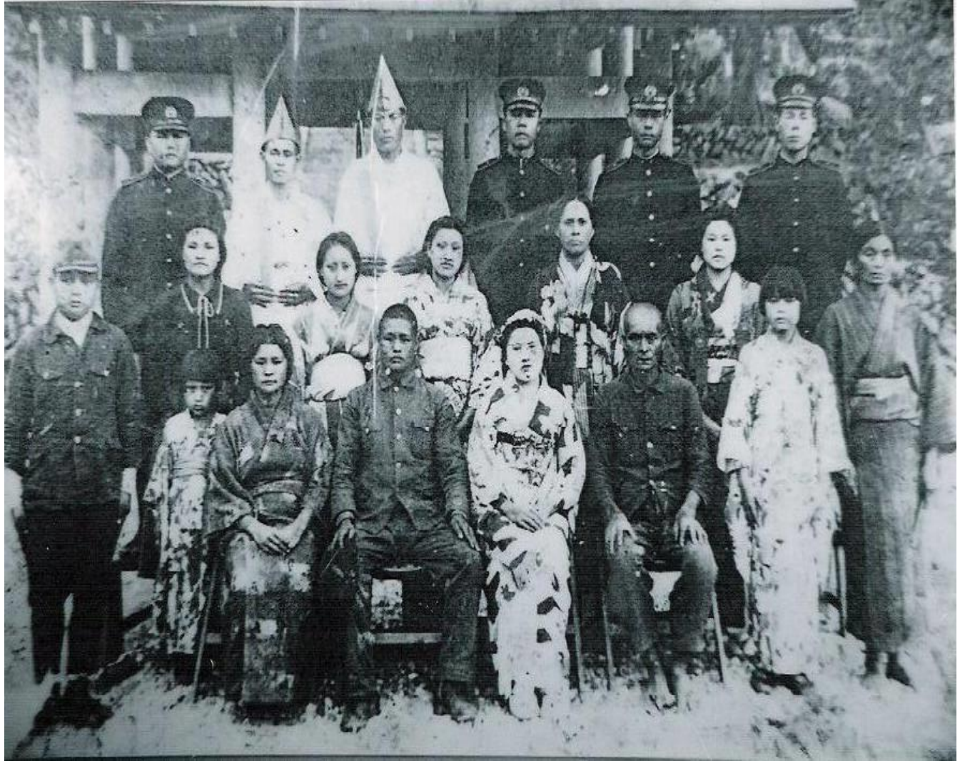
Japanese and Ayatal in Taroko