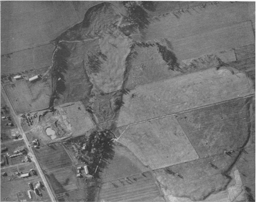
PLATE 2.—Landslide scar near Ottawa. (Facing p. 4)