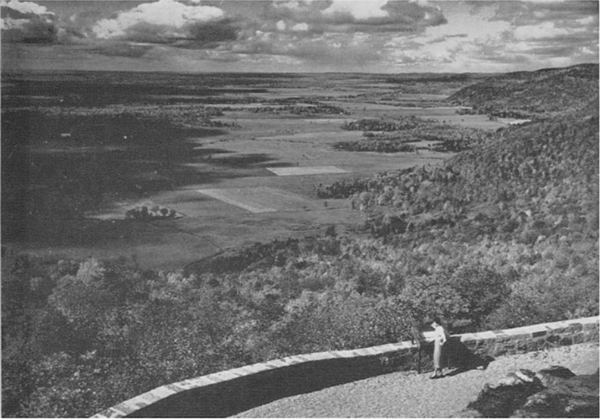
PLATE 1.—View from the Champlain Lookout. The highland and escarpment are composed of syenite and other Precambrian rocks; the lowland is underlain by Ordovician rocks.