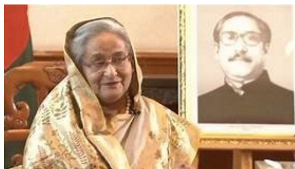
Bangladesh Prime Minister Sheikh Hasina with portrait of her father Sheikh Mujibur Rahman

public relations extravaganza suits autocrats like Rahman's daughter, Prime Minister Sheikh Hasina. The 2018 re-election campaign platform of the Awami League declared that it was the only party that could guarantee Bangladesh's history was properly respected, citing these upcoming celebrations as evidence of its commitment to doing so. Although the rigged election denied the Awami League the veneer of democratic legitimacy, it was hoped that the nationalist pageantry would provide a positive limelight. Taxpayers would provide much of the funding for the two-year saturnalia, supplemented by large donations from cronies who have done well from their connections to the Awami League. But things did not go according to plan.