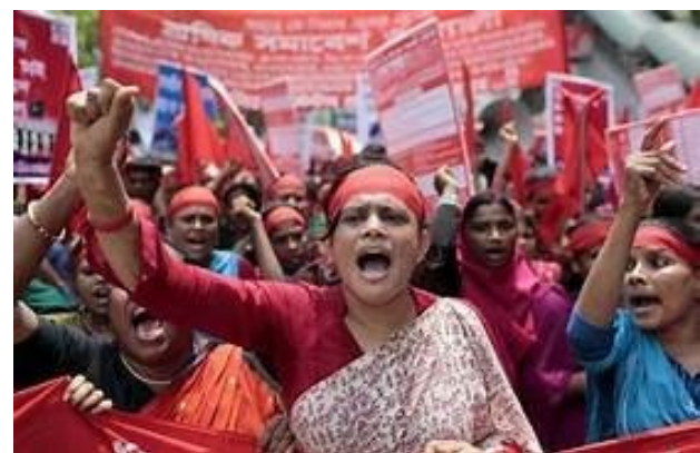
Garment Workers Demonstrating

Formally recognised workers operate under the constant threat of being relegated to an informal worker status by abusive employers in established industries such as agriculture, Big Garment, and migrant labour, which keep operations as informal and unstructured as possible. The doctrine of statutes being