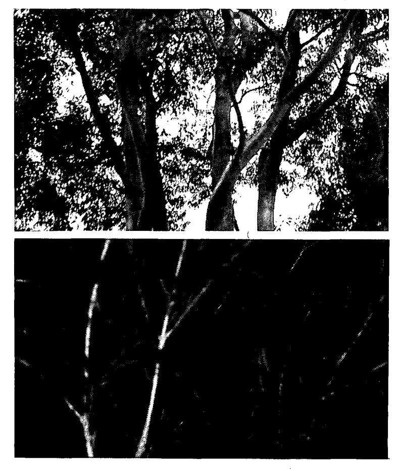
Figure 2 Examples of natural form showing fractal branching

The perceptual sensitivity instruments were first subjected to a principal components analysis with VARIMAX rotation. From inspection of the loaded items for interpretability, three sub-scale variables were created; profiles (rocks and mountain profiles), surfaces (skin, brick, timber surfaces), and branching (tree branches, hairy caterpillars). The commonality of these sub-scale items seemed to be the fractal property of similarity under scaling. The items in the profiles sub-scale showed jagged profiles at scales from 1m to 100m. The items in the surfaces sub-scale showed surface contours and pitting at scales from 0.1mm to 1cm. The items in the branching sub-scale showed branching at scales from 1mm to 10m. Examples of items from this sub-scale are shown in Figure 2.