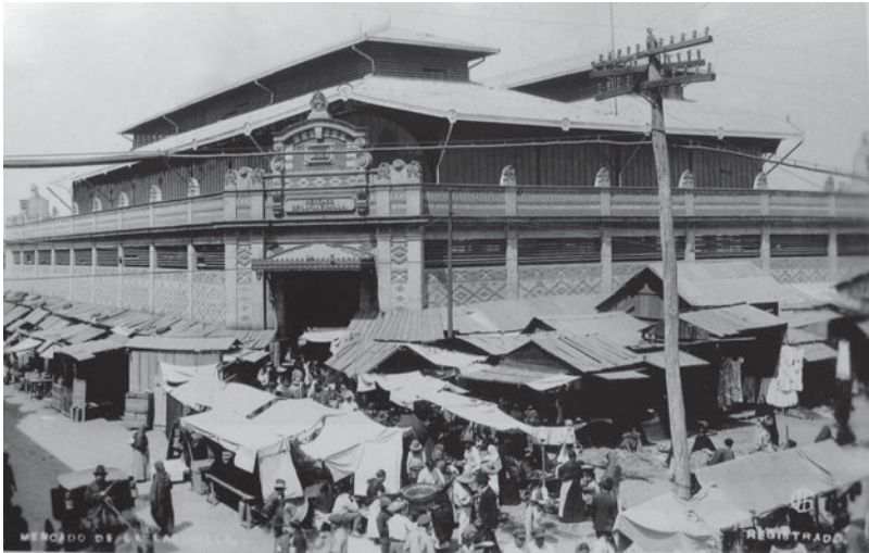
Figure 2. La Lagunilla Market, 1922