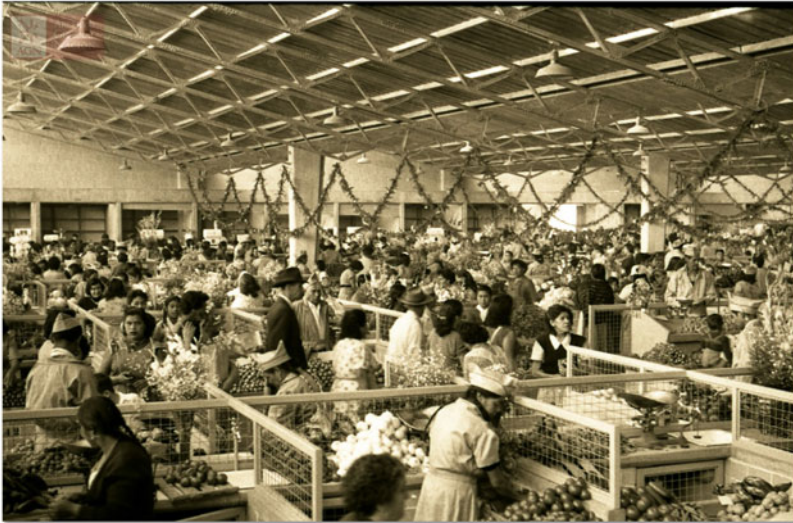
Figure 3. Hidalgo Market, Inauguration Day