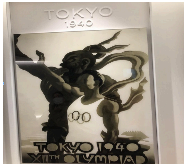
Temple guardian Niō (仁王) has a menacing look.

athlete, right arm thrusting to the heavens, superimposed on the fearsome temple guardian Niō (仁王) whose left-hand rests on the man's shoulder. Niō is well known to Japanese as the temple gatekeeper who wards off evil spirits. Perhaps representing Jimmu was seen to diminish his imagined grandeur.