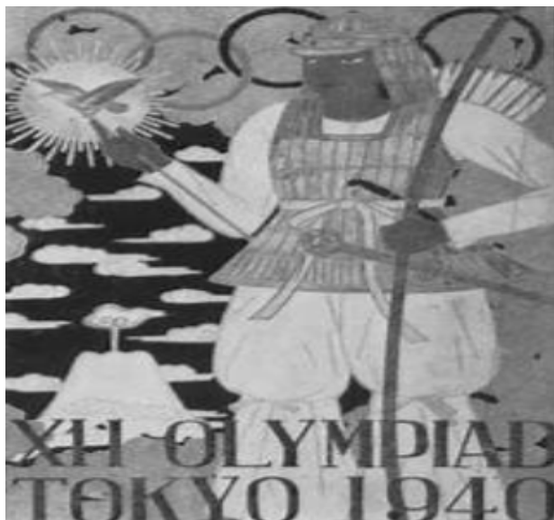
Contest winner Poster featuring mythical Emperor Jimmu

Adjacent to the new national stadium, the Japan Olympic Museum is shaped to resemble an Olympic torch. It has two floors of displays, videos and interactive features that attracts throngs on weekends and holidays. The large sculpture of five Olympic rings in front of the gleaming glass walled tower is a popular photo spot. Inside there are historical dioramas about the origins and evolution of the games, displays of logos from previous games and an interesting section on the 1940 Olympics. There is no reference to the controversy over the 1940 poster and there is almost no information about Tokyo's decision to forfeit the games in 1938. After winning the bid in 1936, there was a public poster competition. The winning entry depicted the mythical Emperor Jimmu, said to be the first emperor, and creator of Japan, whose 2,600th anniversary was being celebrated in 1940.