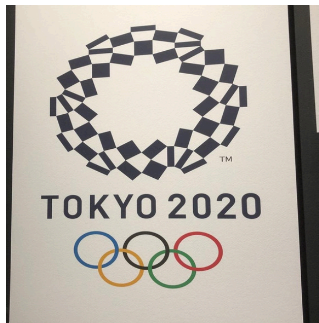
The Olympic logo that replaced the plagiarized design.

On left the design judged to closely copy the logo of a Belgian theater group.