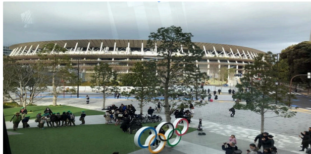
New Olympic Stadium (Photo: Jeff Kingston Jan. 2020)