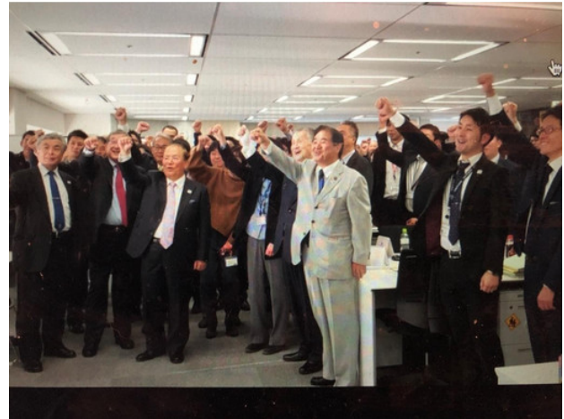
Team Tokyo 2020 Celebrates New Year

acceptance of male applicants probably contributed to Japan's low ranking. It's hard to justify a policy designed to maintain patriarchal dominance of the medical profession.