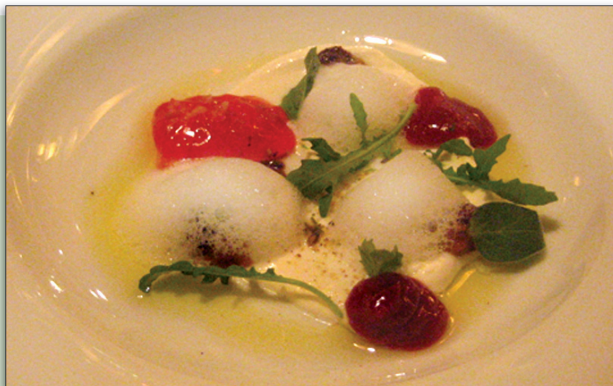
The "sun-dried tomato salad" dish is topped with a foam made from lemon zest.

When talking about molecular gastronomy, some people are quick to point out that scientists have worked on food, particularly food safety, for decades. But