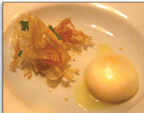
The “parmesan egg” dish looks just like a real egg, but isn’t. Made from parmesan cheese, it has been “spherified,” using a technique borrowed from materials science and used in the minibar’s world-renowned kitchen.