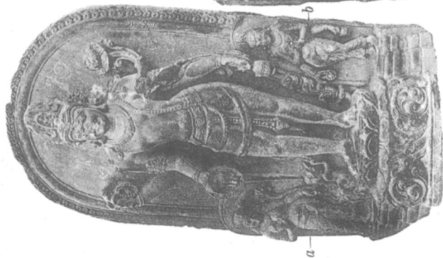
1. AMOGHAVAJRA MAHAKARUNA. (a) TARA. (b) BHRIKUTI TARA.