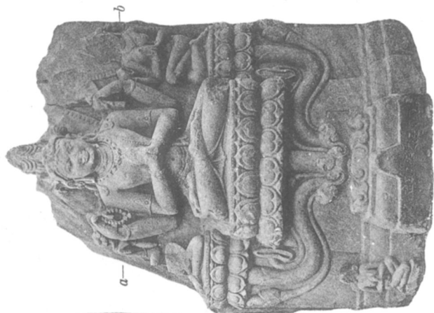
2. CHATURBHUJ AVALOKITA. (a) MANIDHARA. (b) MOTHER OF THE 6 SYLLABLES.