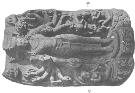
3. AMOGHABRITHA-AVALOKITA. (a) VASUDHARA DEVI. (b) NAGA KING NANDA AND UPANANDA.