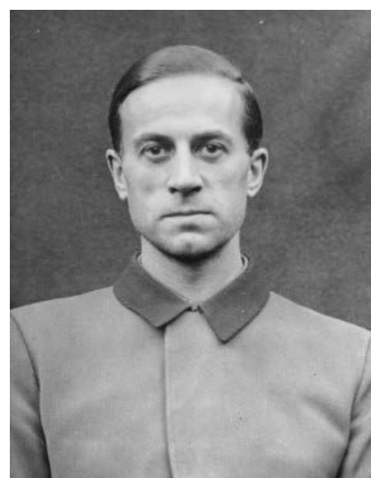
FIG 3 Karl Brandt. Hitler's personal physician and Professor of Psychiatry at Würzburg University, Brandt promoted the T-4 euthanasia programme. He was sentenced to death at the Nuremberg Trials.

Although psychiatrists were not the only health professionals involved in abuses of mentally ill people in Nazi Germany, many reports indicate it was not a minority activity among them. Indeed, it is likely that a majority of practising psychiatrists in Germany at the time supported the Nazi regime and a large proportion identified their patients for the T-4 euthanasia programme. Similarly, many American psychiatrists and academics, such as Robert Foster Kennedy, supported Hitler's euthanasia campaigns. In an editorial in the