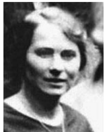
FIG 5 Sabina Spielrein. A founding figure in early Russia psychoanalysis, Spielrein trained in Vienna before moving back to Russia in 1923.

A prominent and outspoken adversary of coercion (compulsory detention), Szasz denied that mental illness exists. In his books The Myth of Mental Illness (1961) and The Manufacture of Madness (1970) he criticised the 'Free World'