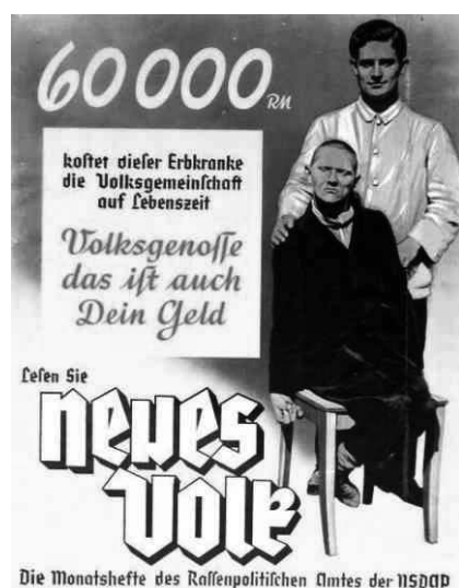
FIG 2 Nazi propaganda poster supporting the sterilisation or euthanasia of people with mental disabilities.

The text reads: 60 000 Reichsmarks is what this person suffering from a hereditary defect costs the People's community during his lifetime. Fellow citizen, that is your money too. Read New People , the monthly magazine of the Bureau for Race Politics of the NSDAP