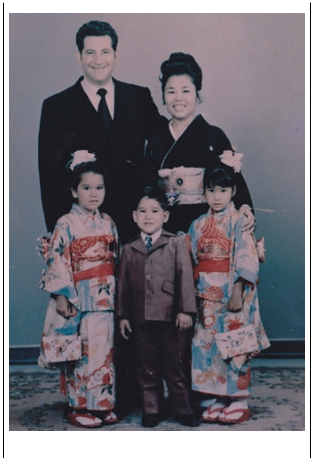
Formal family portrait.