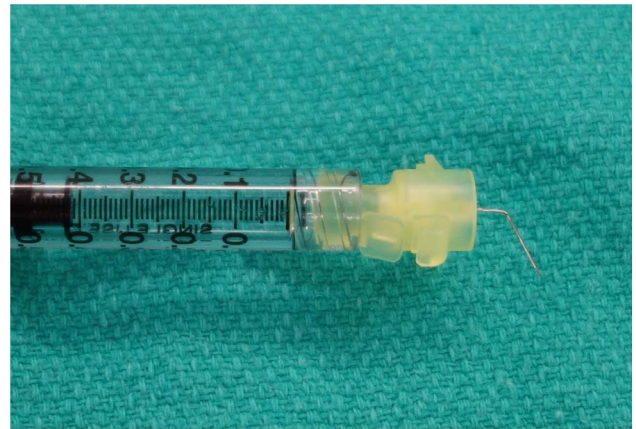
Figure 2: A prepared 30-gauge needle with 60° bend is ready for injection. The lumen is not compromised by the bend procedure.