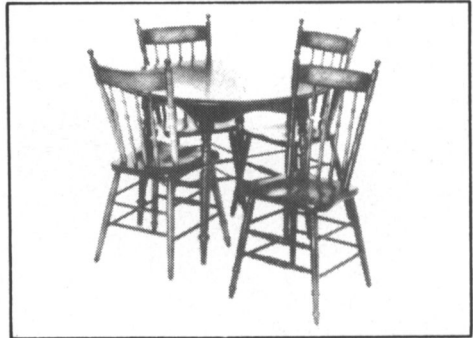
Four traditional spindle-back chairs featuring the original 'KANGAROO' design and a 3'6" diameter round table.