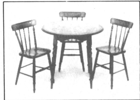
The compact size setting of the original 'KANGAROO' design shows three small chairs, and a 3' diameter round table.