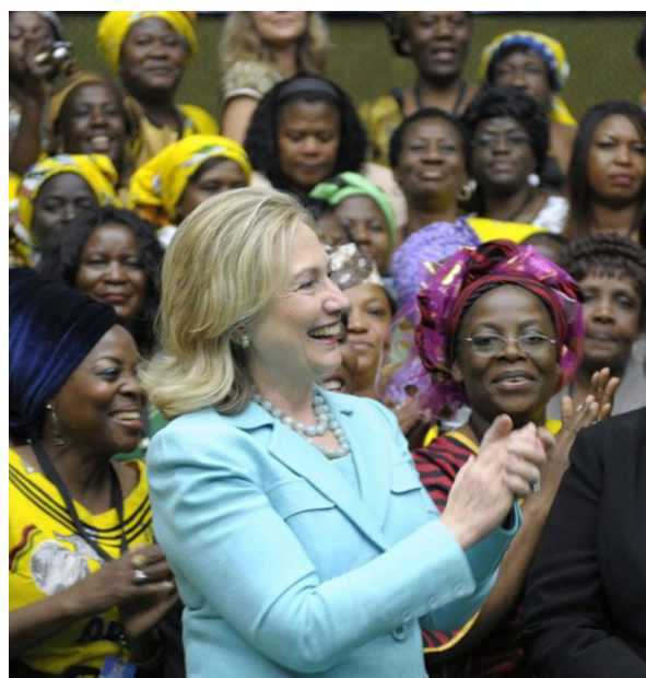
Hillary Clinton in Zambia, June 2011.

While China has cancelled the debts of some of its crisis-stricken partner countries, or offered them grants or zero-interest loans to pay for Chinese development projects, 32 most of the loans issued by Chinese financial institutions have to be repaid by the recipient countries. In certain cases, China allows its partners to pay for their development projects by bartering their local products, in particular natural resources. China and a number of African states have had such countertrade arrangements since the 1980s, and since then China has received key primary products including oil, rubber, and minerals as payment for development loans. 33 These deals involving extraction of natural resources have led to accusations that China is engaging in neocolonialism in Africa, as was voiced by U.S. Secretary of State Hillary Clinton during a visit to Zambia in June 2011. 34 Such criticisms have also been voiced by a number of African leaders who are concerned about China's growing economic clout. 35 While popular African perceptions of China's economic engagement remain generally positive across the continent, 36 positive public opinion