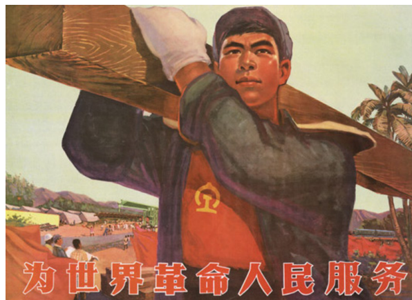
Serve the revolutionary people of the world, 1971.

China has become Africa's largest trade partner, and Africa is now China's second largest overseas construction project contract market and the fourth largest investment destination ... Up to now, China has completed 1,046 projects in Africa, building 2,233 kilometers of railways and 3,530 kilometers of roads, among others, promoting intra-African trade and helping it integrate into the global economy. 17