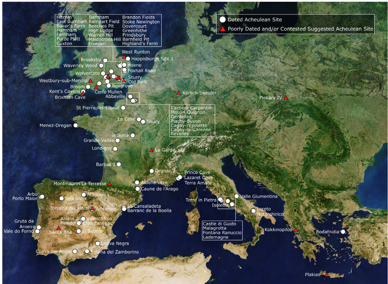
Figure 1. Location of each dated Acheulean site in Europe (white circles; reliability graded three to one), alongside a series of undated or poorly evidenced biface occurrences that are sometimes suggested to be Acheulean occurrences (red triangles). The latter are noted here due to being widely known, spatially remarkable (e.g. Piekary IV) or being of importance to the discipline in another way.

followed by the Acheulean's later reintroduction from elsewhere in Eurasia or Africa (Figure 3). If the record of interest is not statistically exceptional or surprising relative to the main site sample, then persistence of the Acheulean across the investigated temporal gap can be supported.