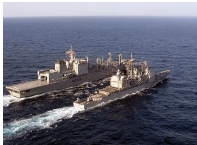
Japanese refueling mission in the Indian Ocean

Japanese Maritime Self-Defense Forces, meantime, while engaged in refueling activities for CTF-150 vessels in the Indian Ocean, operate within the effective bounds of Japan's domestic policing laws, possessing as yet neither the constitutional leeway to engage in forcible maritime interdiction on the high seas with arms drawn nor the authority to escort vessels other than Japan-registered ones.