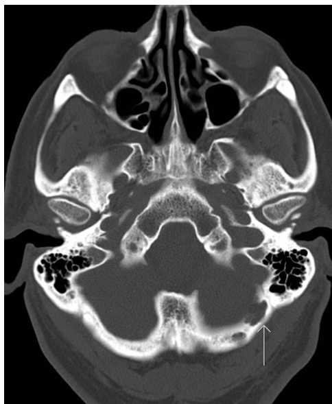
Figure 2: CT bone window image of arachnoid granulation pits in the posterior fossa.