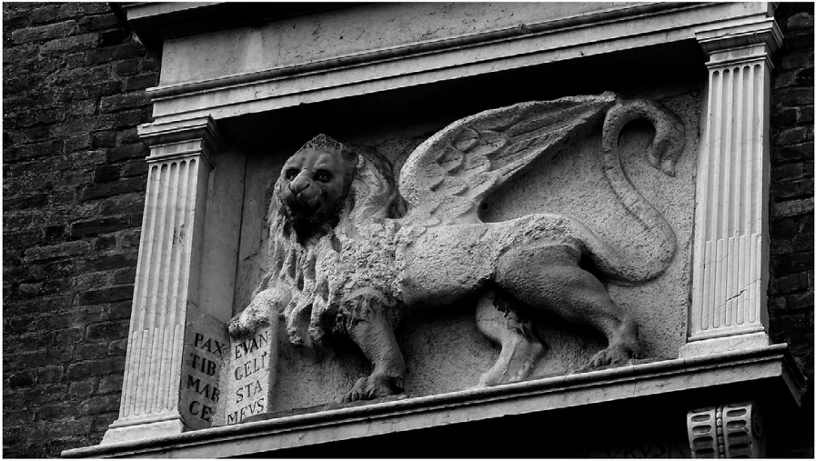
Figure 1. Lion of St Mark. Botticino stone, Crema, Palazzo Pretorio (formerly at Porta Ripalta), 1490.

their function as political or religious symbols. 46 However, political participation was not only expressed through the offence and defence of sculptures or images. In some cases, statues could materially epitomize the people's many voices. The well-known 'talking statues' or 'speaking sculptures', for example, were positioned in cities' busiest public locations and represented intermedia cultural objects, involving – thanks to the pasquinades posted on them – written, architectural, oral and visual forms of political communication. 47 These statues, and other objects discussed below, embodied the intermediality of early modern political interactions and acted as urban nodes of complex communication networks. 48 In Venice, for instance, the marble statue of the Gobbo and the low column which stands beside it (the pietra del bando ) were simultaneously an example of intermedia functionality and of the multiple meanings of public spaces. Located in the campo San Giacomo near the Rialto bridge, this architectural element was used by town criers for making their announcements or by street singers working the busy market area for their aural performances, while