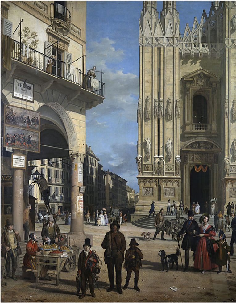
Figure 4. Angelo Inganni, View of the Piazza del Duomo with the Loggia dei Figini , 1838. Oil on canvas, Milano, Palazzo Morando – Costume Moda Immagine, inv. 832.

example, Girolamo Priuli noted how in various Italian cities, Venice's political adversaries launched a polemical offensive against the Republic, targeting public spaces such as piazzas, barbershops and brothels, where people gathered to get up to speed on the latest political news. 72 In his well-known encyclopaedia of professions, Piazza universale di tutte le professioni del mondo (1585), Tomaso Garzoni stigmatized those people who 'spend all of their time strolling in the square, going from the taverns to the fishmongers and from the palace to the loggia, doing nothing else all day but wandering here and there, now hearing singing among the stalls...now