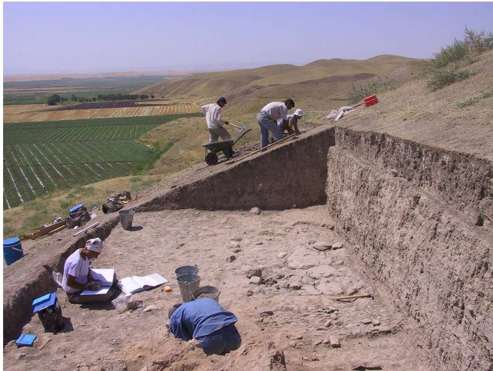
FIGURE 2. Even on the same excavation project, teams working in different trenches may use different terminology, or they may record at different levels of specificity and detail. The SLO-data project found that differences in documentation occurred especially where teams worked in trenches located far apart (Faniel et al. 2020). Having an individual whose role is to spend time in each trench can help with consistency in data collection and ease of data integration across various parts of a project. What other practices can research teams adopt to make data collection more consistent and cohesive?

on argumentation and critique helps situate data as a central concern for scholarship rather than technical proficiency with a specific software application. Archaeology offers rich opportunities to promote broader data inclusivity. Archaeologists must grapple with the interpretive challenges of incomplete and often ambiguous data (Faniel et al. 2013; Kansa 2012). Explicit documentation and justification of potentially contestable analytic steps can strengthen the rigor of archaeological knowledge claims. Emerging reproducible research practices emphasize use of open data together with greater transparency and public documentation of analytic and interpretive steps in research workflows with data (Marwick et al. 2017). If presented through accessible forms of pedagogy, reproducible research in archaeology can empower students to peer into the black box and evaluate the steps used in making claims with data.