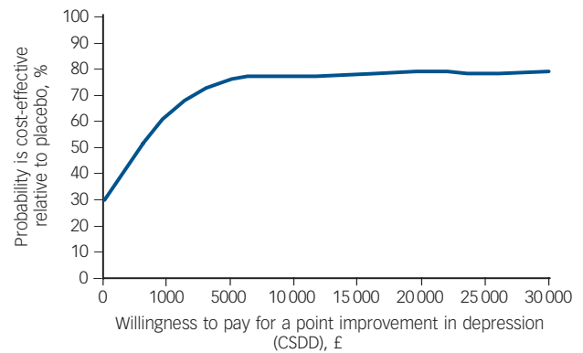
Fig. 1 Probability that mirtazapine is cost-effective compared with placebo: health and social care costs and Cornell Scale for Depression in Dementia score (CSDD) over 39 weeks.

Figure 2 shows the CEACs from the secondary economic evaluation, where health and social care costs including unpaid carer inputs and health and social care costs excluding unpaid carer inputs were considered alongside QALYs in turn. It suggests that from a health and social care perspective mirtazapine was