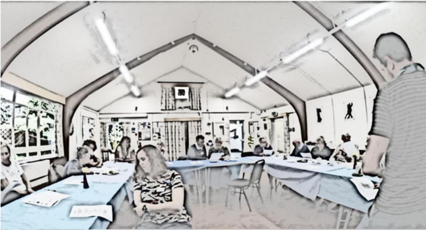
Figure 2. A village hall where a quiz is taking place.

of volunteers in places like memory cafes (Light and Delves, 2011). These large collective spaces and groups of people provide two key materials for a quiz to take place: a space large enough for a group and a number of potential players (Figure 2).