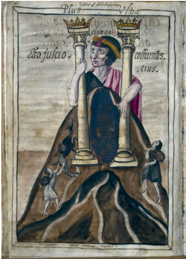
Figure 3 Martín de Murúa, “Allegorical Image of Potosí,” in Historia del origen, y genealogía real de los reyes ingas del Piru , f. 141v, 1590, Private Collection.

coloniality of the more-than-human world to discuss the current ecological crisis as a major consequence of modernity’s fixations.