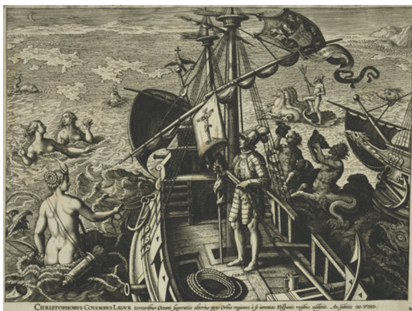
Figure 1 “Christopher Columbus on his Ship,” from The Discovery of America (Americae Retectio) series, Adriaen Collaert, after Jan van der Straet, engraving, c. 1589.